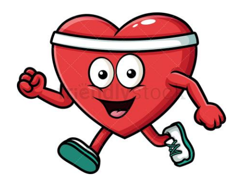
-- Doris Ries